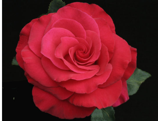
'Let Freedom Ring' By: Rich Baer

AFFILIATED WITH THE AMERICAN ROSE SOCIETY