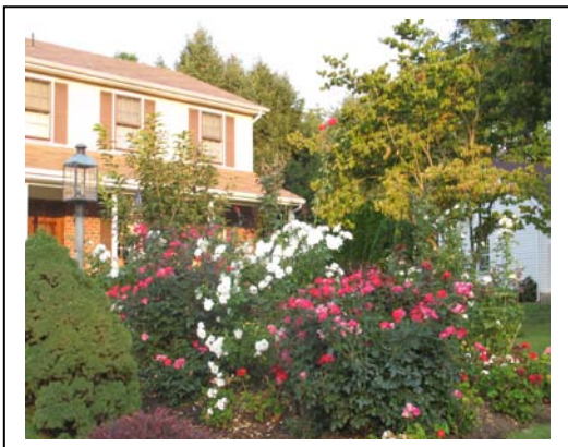
Flower Bed @ Terry Palise's Home

Bring photos of your rose beds to the December 16 th meeting.